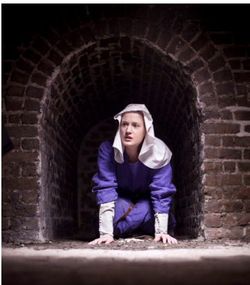
A recess and a reconstruction, filmstill film super8, 20mn, 2011

This performance was conceived not only in the context of The Thousand Dreams of Stellavista , but also in advance of their solo at the art centre (late February to mid-May 2012).